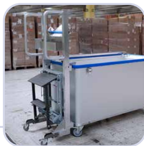
Ladder, push aid, drink holder, scanner holder, label dispenser, writing tablet or clipboard